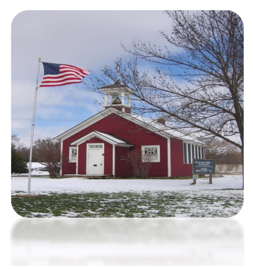
Maine Education Policy Research Institute - 2013

An Examination of Distinguishing Features of a Sample of Maine's Improving Public Schools