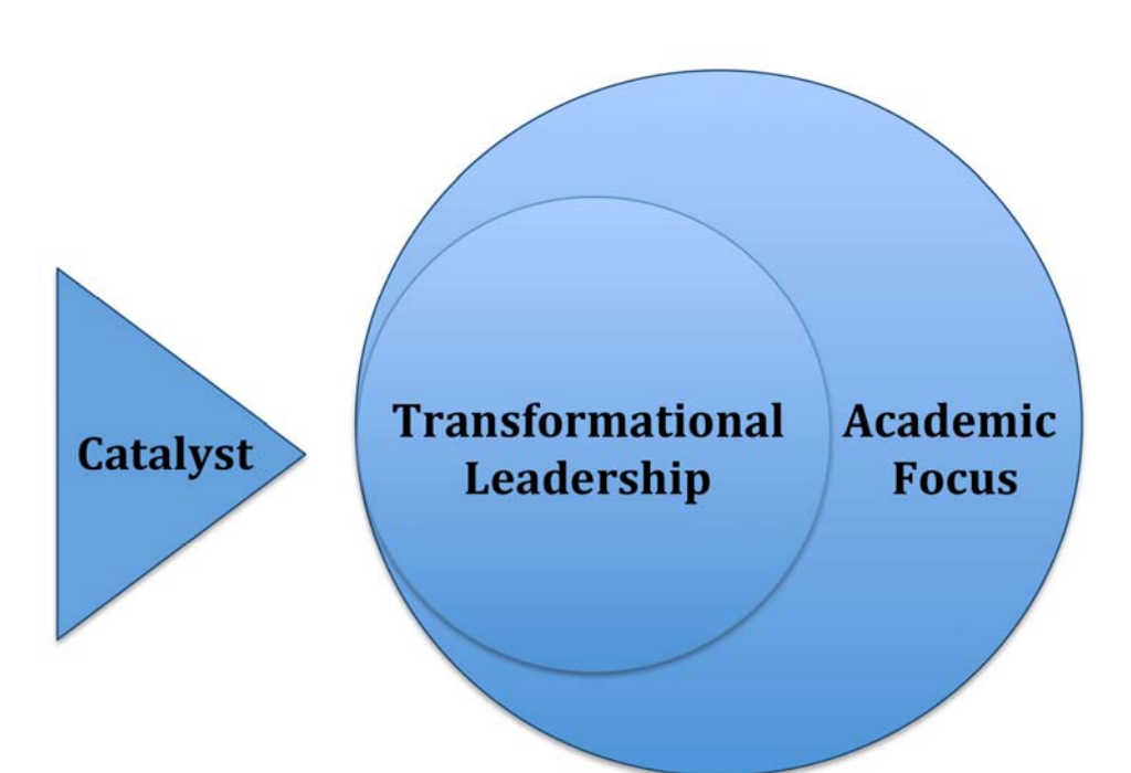
Figure 2. Progressive Components of Improving Schools